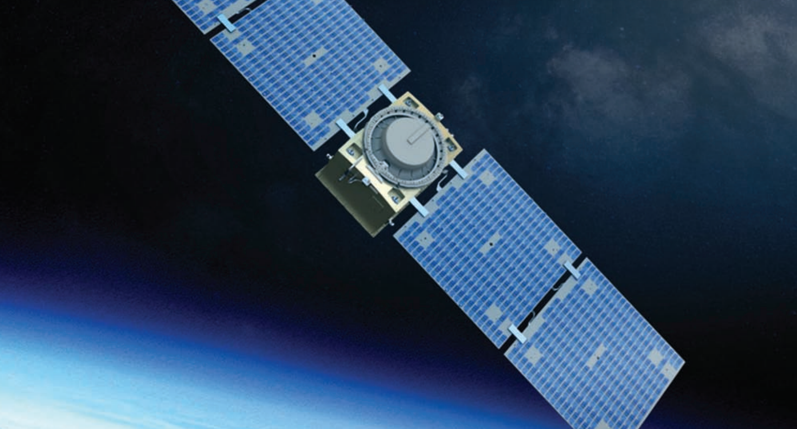
Moog's ESPA class bus product called METEORITE.  ●●●